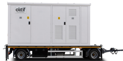
SMS - 1